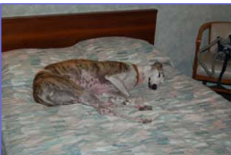
Vinny calls it a night at 7:30!

Once settled into the room, we went to the ocean. It was about 90 yards from our door. It was getting dark by then, but we were able to do a little splashing before calling it a night.