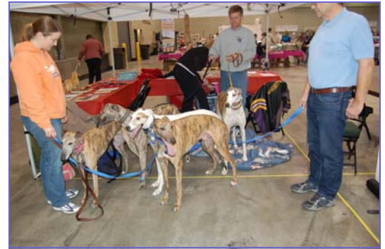
Hounds and volunteers enjoyed meeting Pet Expo visitors!