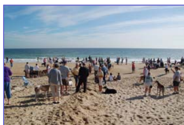
Greyhounds rule Dewey Beach!

Each morning, the greyhounds gather on the beach for a morning walk. What a sight seeing hundreds, if not thousands, of greyhounds at one time. Breathtaking!