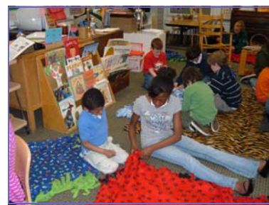
Working hard for the hounds!

GPA-MN had the honor of receiving 15 hand-tied fleece blankies tied with tender loving care by the little hands of about 19 kindergartners and several 5 th grade buddies at the Blake School in Hopkins. Each class within the school does service projects throughout the year with an all school day devoted to service projects called Legacy Day in the spring. Last spring some of the projects included tying fleece blankets for an orphanage in Kenya and packing food for Feed My Starving Children. The kindergarten class also collected shoes for this same orphanage as well as raised enough 'change' by doing jobs at home to buy