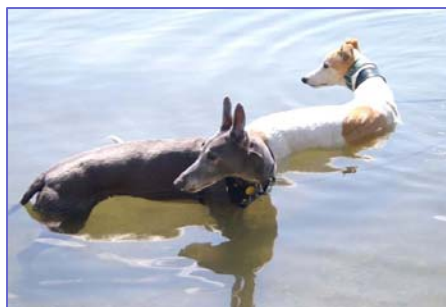
Blew takes a dip at the Lake!