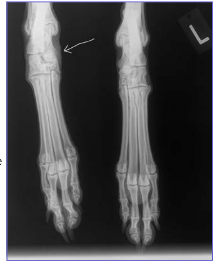
This x-ray shows the shattered bones of Wrangler's right ankle joint (left side of the picture). At the right side of the picture, you can see the bones in the left leg joint are well-defined, but the shattered bones of the right leg joint (near the arrow) are blurry and scattered.

Wrangler is the latest beneficiary of your generous donations to the GPA-MN "Heal a Hound" fund. Thanks to your support, GPA is able to take in dogs like Wrangler that require special medical care before going to their forever home. Wrangler thanks you!