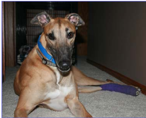
Wrangler relaxes and recovers after surgery.

Wrangler is an absolute joy to have as a foster. He gets along extremely well with other dogs, including both of our hounds and the neighbor's Golden Retriever. He is very energetic; probably more so than he normally would be because of his mandatory kennel time to keep him from over working his leg during the healing process. His buoyant spirit has helped him