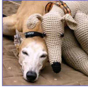
Make sure your hound has a "safe space" when your family and friends gather at your house for the holidays!