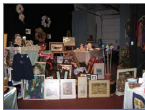
Hope Santa will leave one of these fine crafts in my stocking!