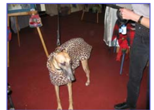
One SERIOUS shopper!