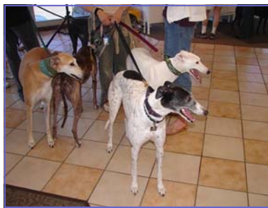
Hounds on the sales floor at Lupient Chevrolet of Bloomington