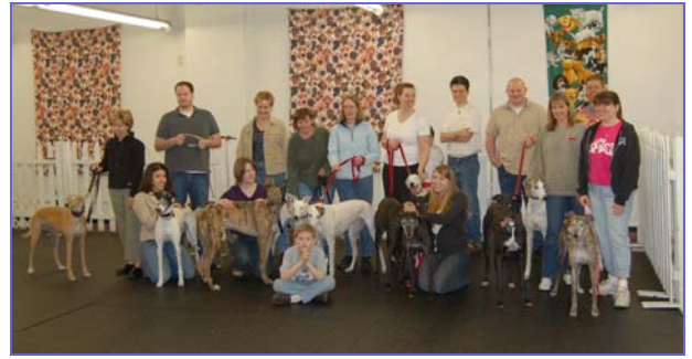
Graduation night! Happy hounds and owners.

My goal for the class was to get Angie ready to be a therapy dog; she needs to pass the AKC's Canine Good Citizen (CGC) test. The class went through everything we would need for