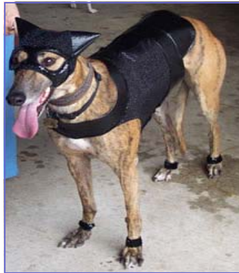
Halle Berry ain't got nothing on this grey girl!